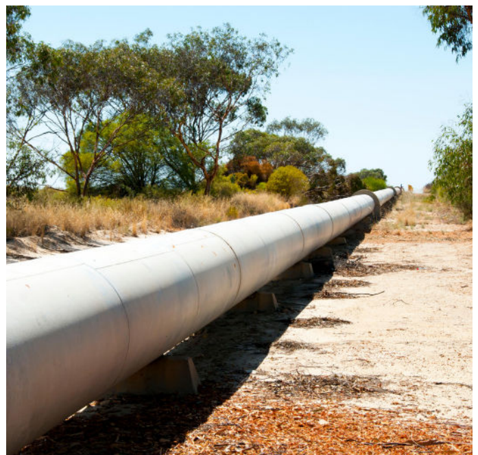
Image: Example of an aboveground water supply pipeline.