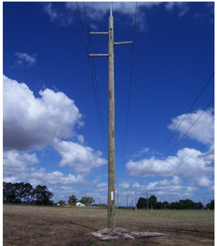
Image: Example of a 132kv single pole powerline.

Transportation corridors are still in design phase with road and/or existing rail infrastructure options being considered.