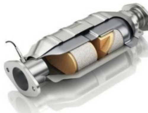
Example of a catalytic converter in a passenger vehicle, which requires a significant amount of palladium and/or platinum to manufacture.

The PGEs, nickel, copper and cobalt metals also have a key role to play in electric, hybrid and hydrogen fuel cell vehicles. As such the Julimar discovery is considered globally significant and could become a major green energy metal mine of the future.