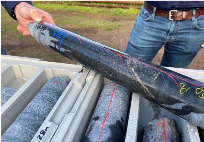
Example of a drill core sample at the Julimar Project, from the main Gonneville discovery located on private farmland.