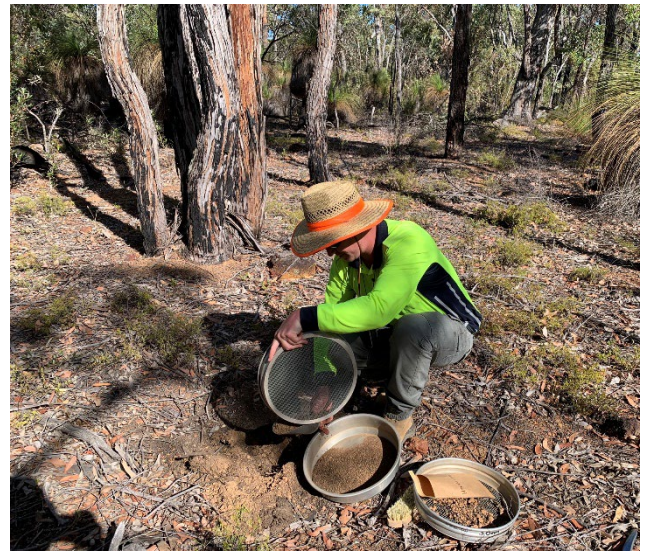
Chalice staff conducting surface soil sampling in the Julimar State Forest in February 2021 – a low-impact activity. The approved exploration activities within the JSF will have negligible impact on vegetation and fauna, as no clearing or ground disturbance will take place.