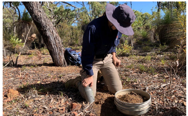
Chalice staff conducting low-impact soil sampling in the JSF.

These low-impact activities will be completed largely on foot, with vehicles used only along existing tracks. The primary purpose of these activities is to effectively screen large areas for minerals with minimal impact.