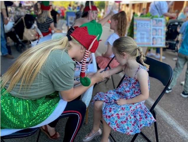
Free face painting was part of the festivities at the 2020 Toodyay Christmas Street Party.

A number of the Chalice team and their families joined in the Street Party!