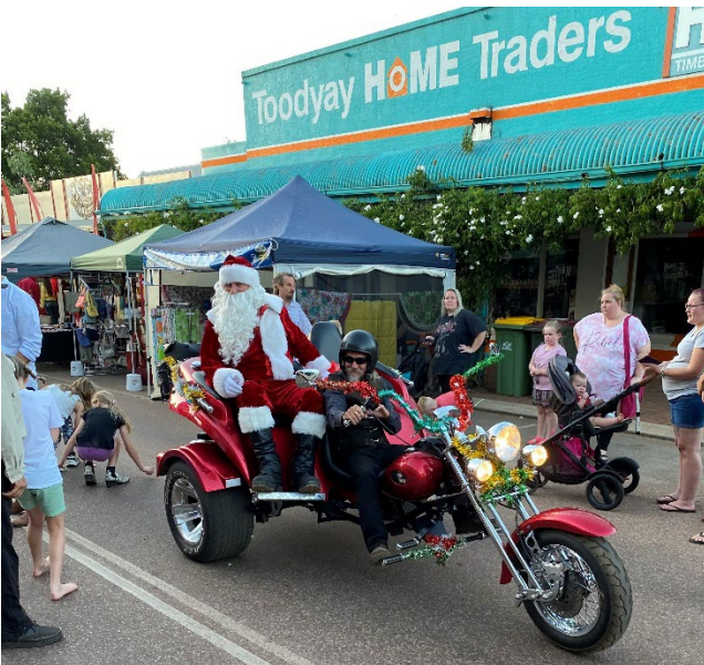
Santa arrived in style, much to the delight of guests at the 2020 Toodyay Christmas Street Party.