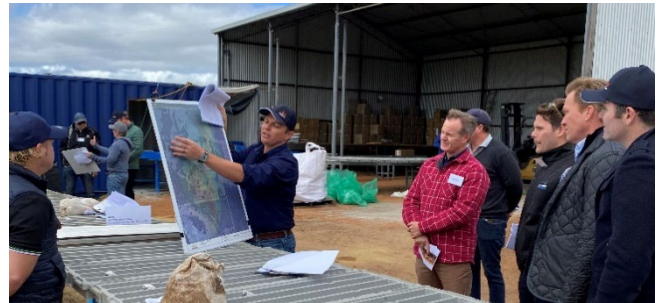
Onsite with visitors at the Julimar Project.

The recent events are a timely reminder of the increased fire risk during the summer months. Chalice has robust fire prevention and response procedures in place, adheres to all fire ban and movement ban restrictions and is committed to ongoing team training and community support.